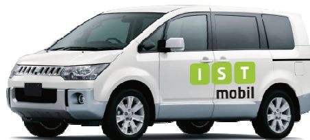
Figure 1: ISTmobil vehicle

Another important aspect is to foster cooperations and increase coordination of the different mobility services, which leads to the pooling of regional transport providers.