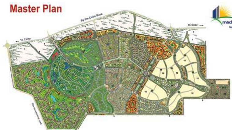
Madinaty Master Plan

Madinaty that provide major services; open-air shopping areas (like the promenades, for pedestrians only) or malls for international brand names. Technology is utilized to optimize the water used for the irrigation of the existing gardens and golf courses available.