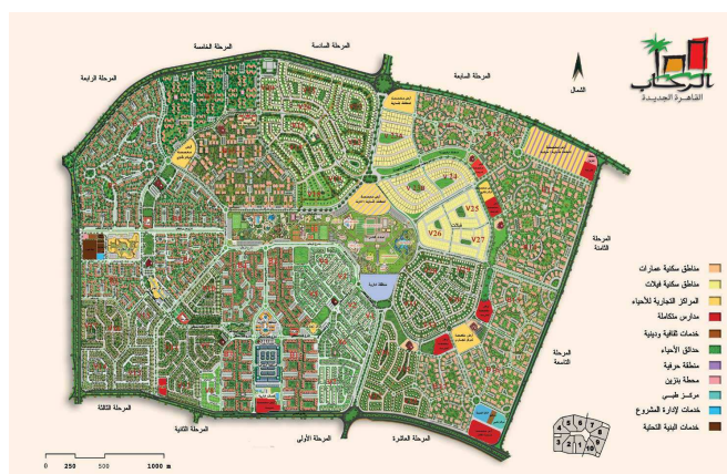
El-Rehab city Master Plan

Primarily intended for the lower middle class in the mid nineties. Upon its success, it was transformed into one of the most expensive communities. An escape from the original crowded, overpopulated, noisy and polluted districts. Switching home from an apartment to a villa, residents chose El-Rehab city seeking for a better quality of life; private, quiet, green, and healthy environment, with all services included. One of the most successful aspects on which it was based on is the provision of services and transportation of bus lines to and from and from Cairo.