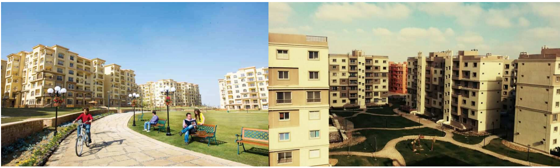
green and play areas

This suggests that yes, indeed Madinaty has unconsciously applied several aspects of smartness. The case at hand can be considered as a pilot, underdeveloped project that can be developed into a real “smart city” example. Despite the fact that some aspects are still in their birth phase, and other aspects are still controversial, yet, it can be argued that such project is an integrative approach for understanding initiatives that smart cities revolve around, such as governance, policy context, economy, technology, roads, open/public spaces, buildings and infra structure, people and community and safeguarding the natural environment.