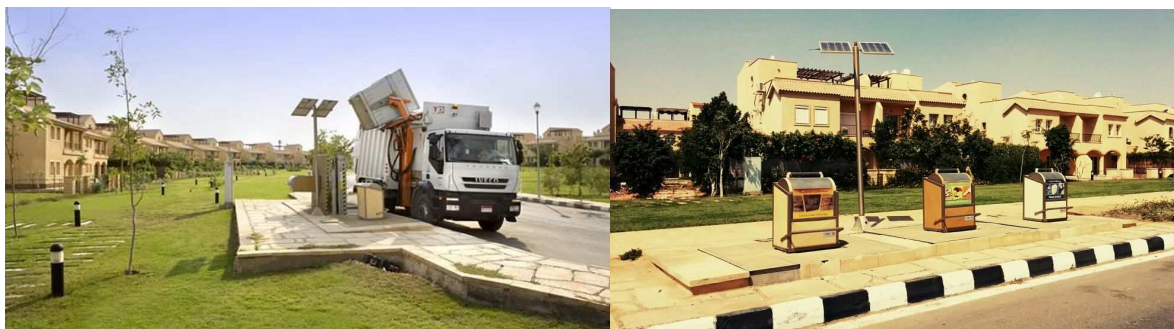
waste management and solar panels

Seems also environmental smartness in Madinaty is in its birth phase. However, the city proved to be on the track, with respect to the application of renewable energy, reducing environmental stress, recycling, waste management, minimizing resources. However, there proved to be no clue on the monitoring and decreasing environmental impact. There seem to be lack of awareness with respect to the concept of environmental smartness, as a core, basically- which is a dilemma in the Egyptian paradigm in general. Solar panels appeared here and there, use of recycled water was obvious, however, many other envirnmental aspects are missing.